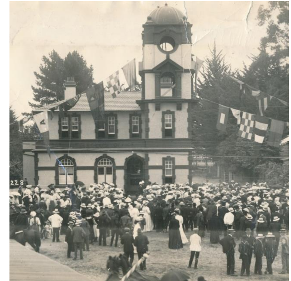
Cambridge Post Office Cambridge Museum collection